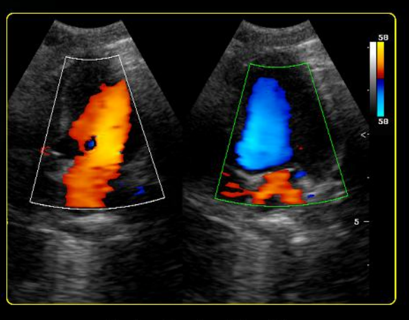
Canine Cardiac Blood Flow

The U60 provides excellent detail, contrast resolution and image uniformity without sacrificing penetration. Excellent color and Doppler sensitivity easily detects small, low flow vessels.