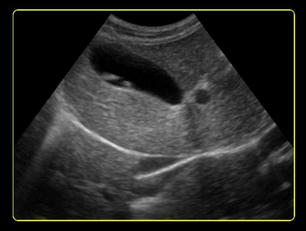
Canine Gallbladder Polyps