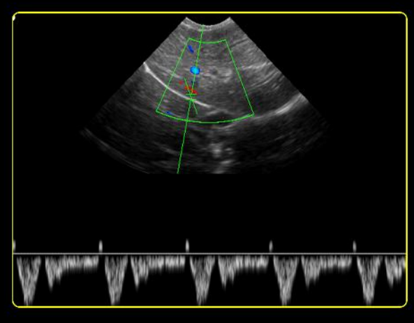
Canine Liver Artery PW Doppler